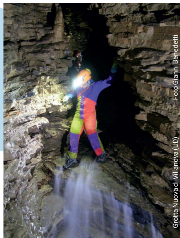
Grotta Nuova di Villanova (UD)

The Federazione Speleologica Regionale of Friuli Venezia Giulia was established in 1997. It organises exhibitions, regional meetings and speleo-congresses. It has authored many thematic publications and, for more than 10 years, edited the paper edition of the monthly newsletter La Gazzetta dello Speleologo , now an online magazine. It has organised speleological expeditions and scientific researches. It promotes and coordinates campaigns for the protection of the environment, training courses and stages and other initiatives always at a regional level. It has developed many projects among which the promotion of Led lamps instead of acetylene torches and the positioning of identification plates by the entrance of natural cavities. From 2007 and for 10 years it has managed, thanks to an agreement with the Regional Governmental Authority, the Regional Cadastre.