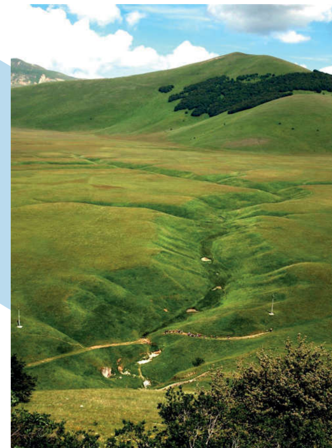
Inghiottoio del Piano grande dei Sibillini, Umbria, Italia