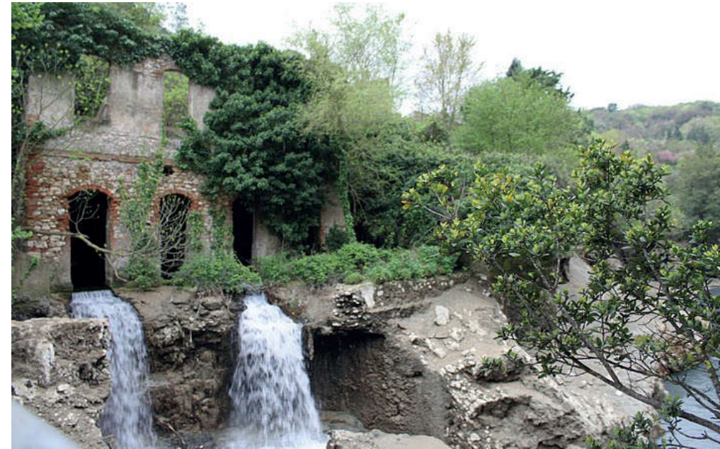
Stifone Springs - Gole del Nera - Narni

In Umbria there are numerous sources of karst origin, including the Scirca spring, which collects the waters of the Grotta di Monte Cucco and feeds the aqueduct of Perugia the springs of the Narni Gorge which together reach a flow rate of 13 m 3 s draining the waters of the Narnese Amerina ridge and a large part of the deep hydrological system of southern Umbria.