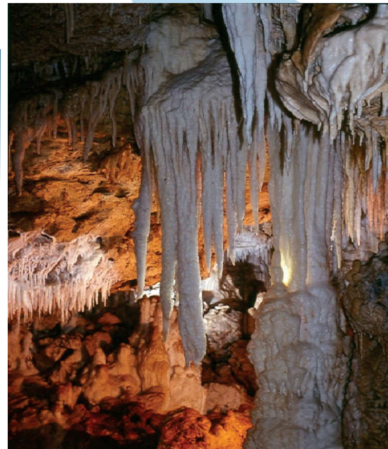
Pozzo della Piana, Orvieto