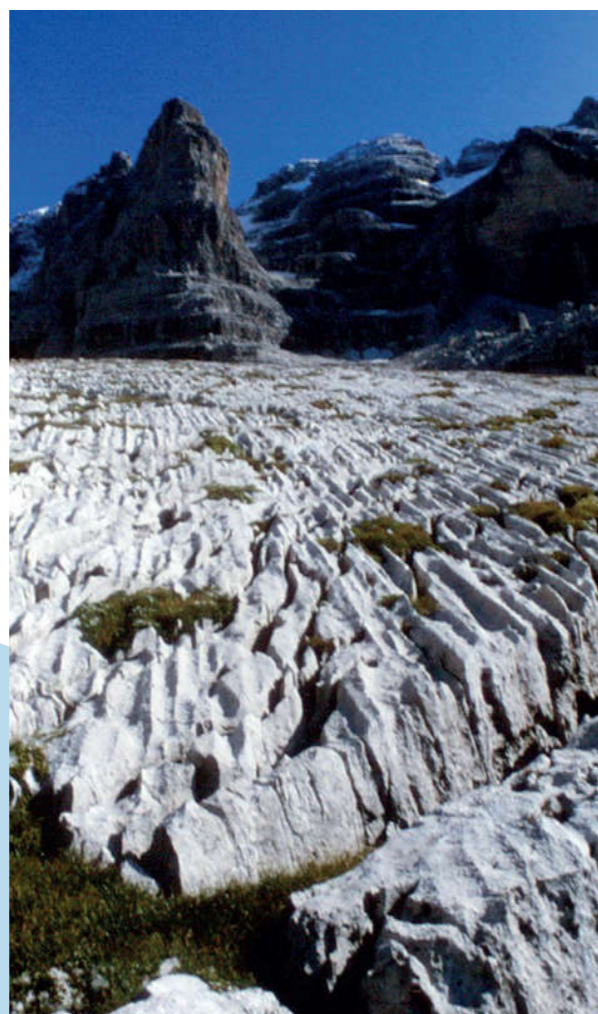
Forme carsiche di superficie presso rif. Tuckett