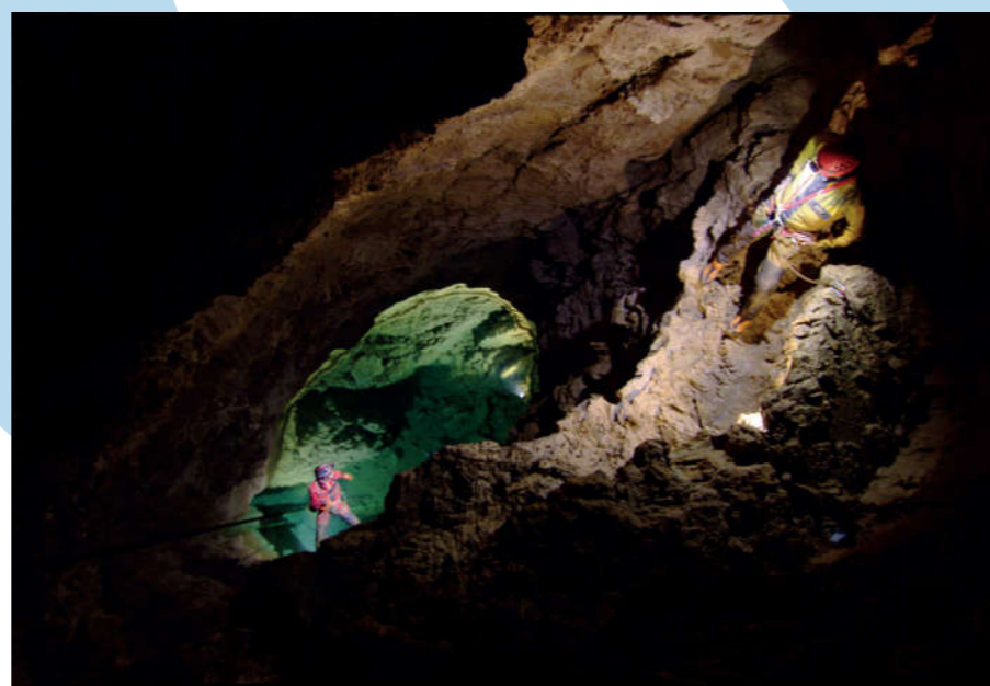
Abisso di Lamar