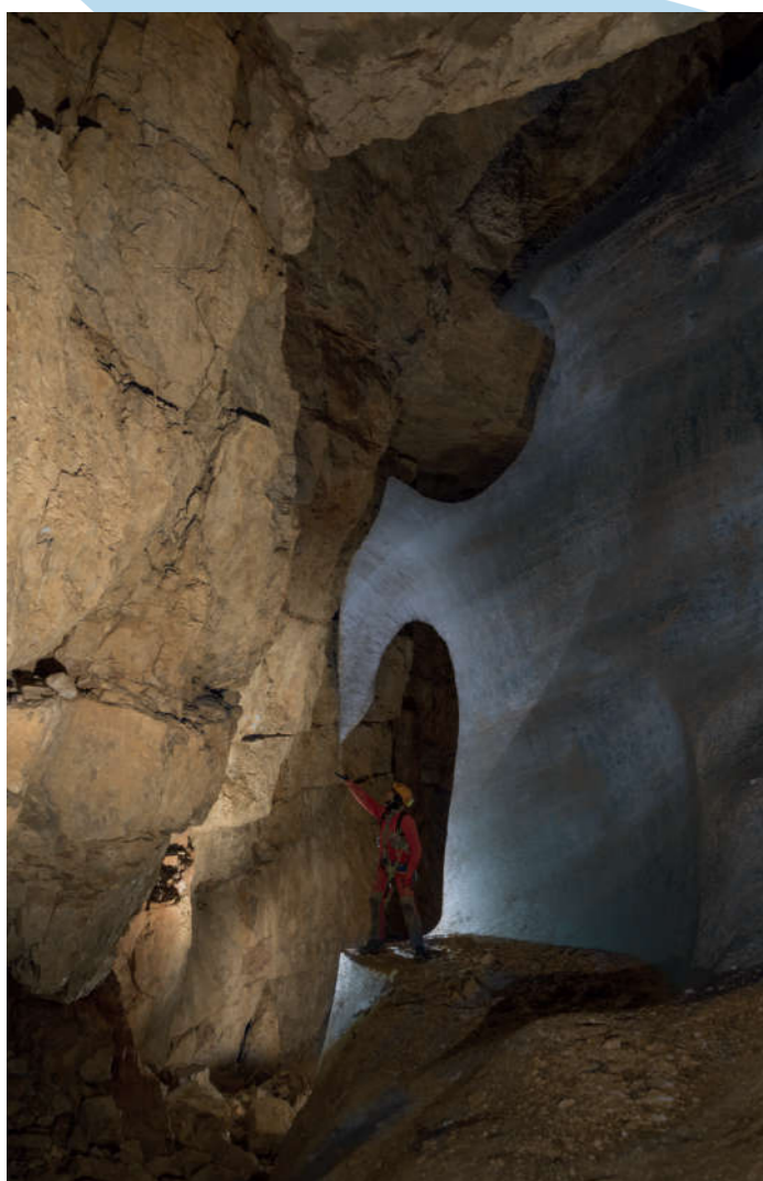
Grotta del Castelletto di Mezzo