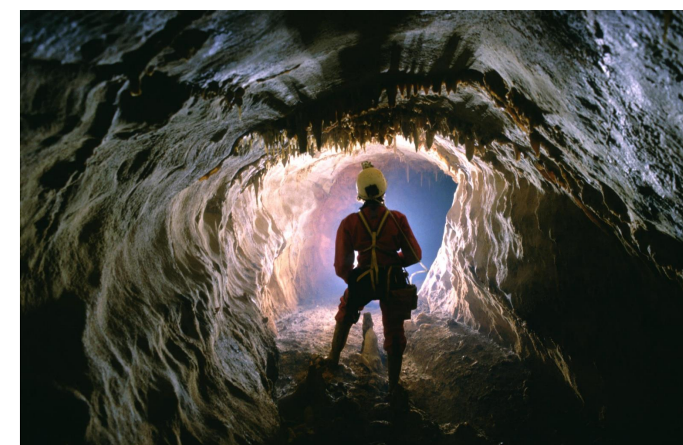
Grotta di Serra del Gufo (Cerchiara di Calabria - CS)