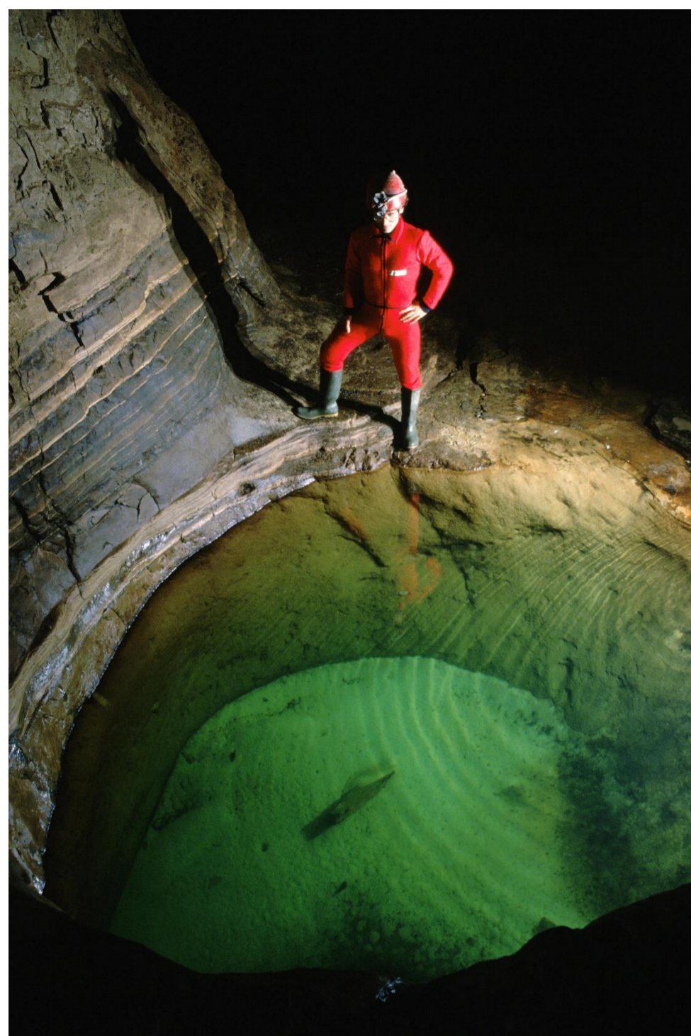
Speleological complex "Le Grave" (Verzino and Castelsilano - KR)