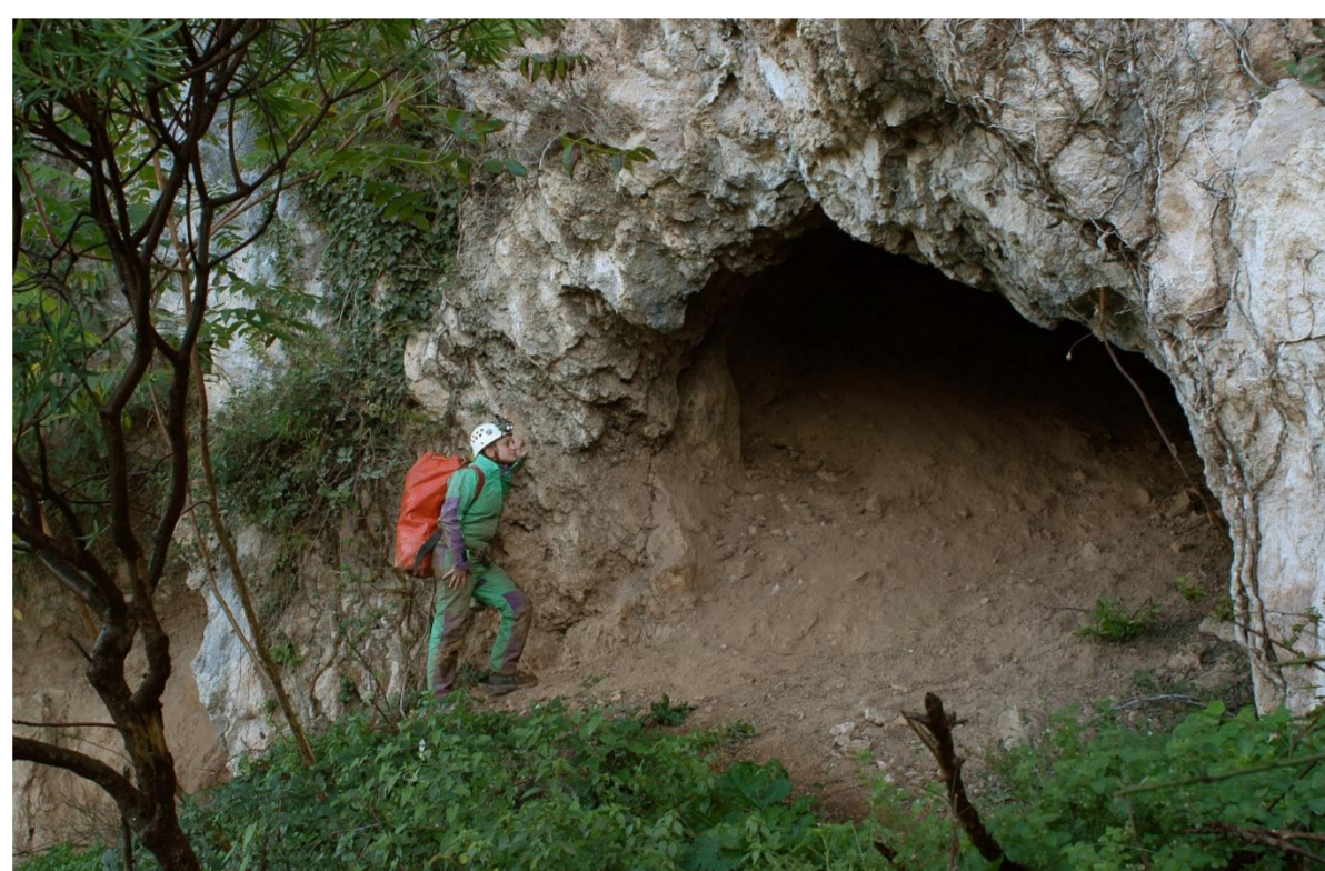
Entrance of the Grotta dell'Eremita (Canolo - RC)