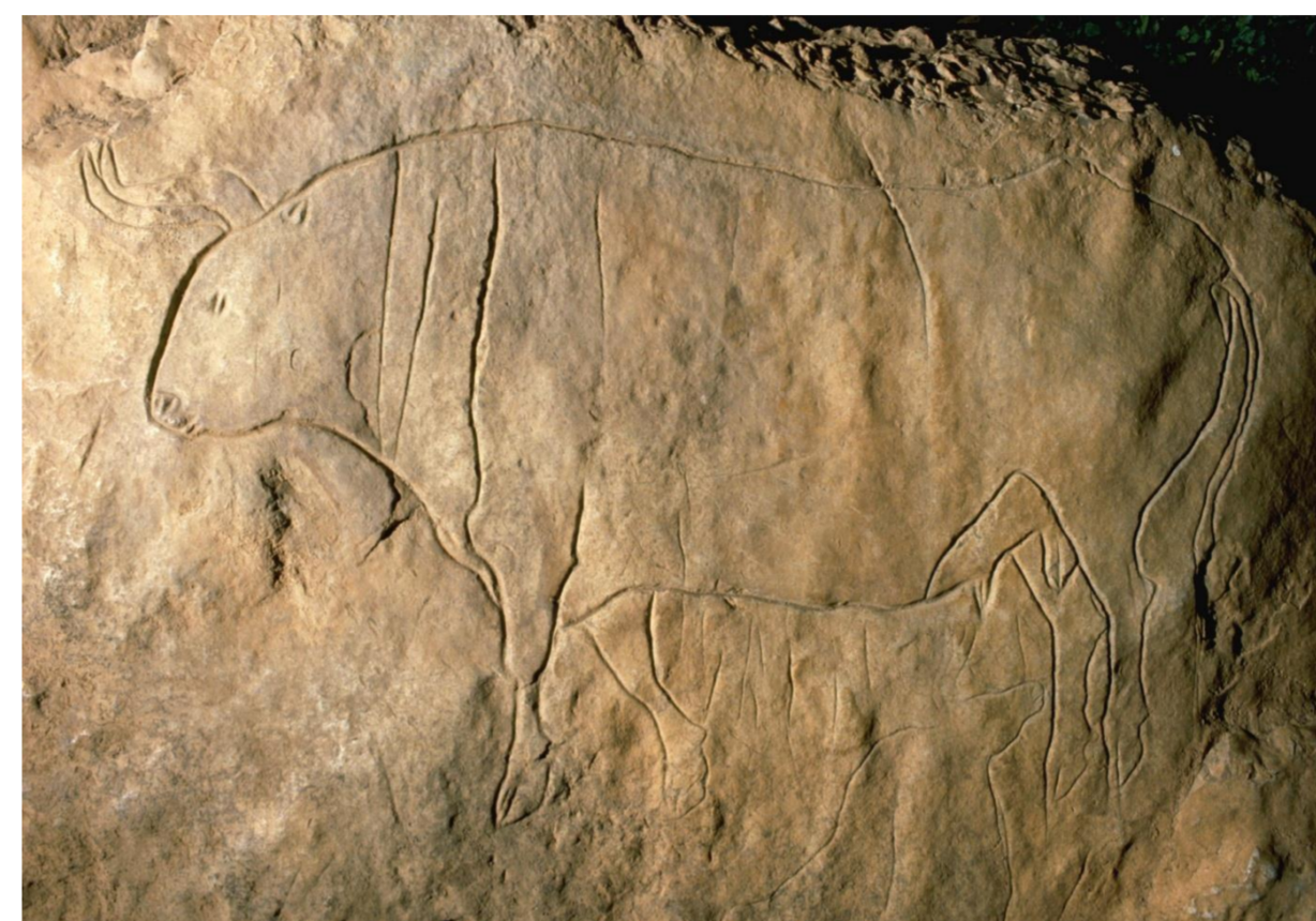
Palaeolithic engraving within Grotta del Romito (Papasidero - CS)