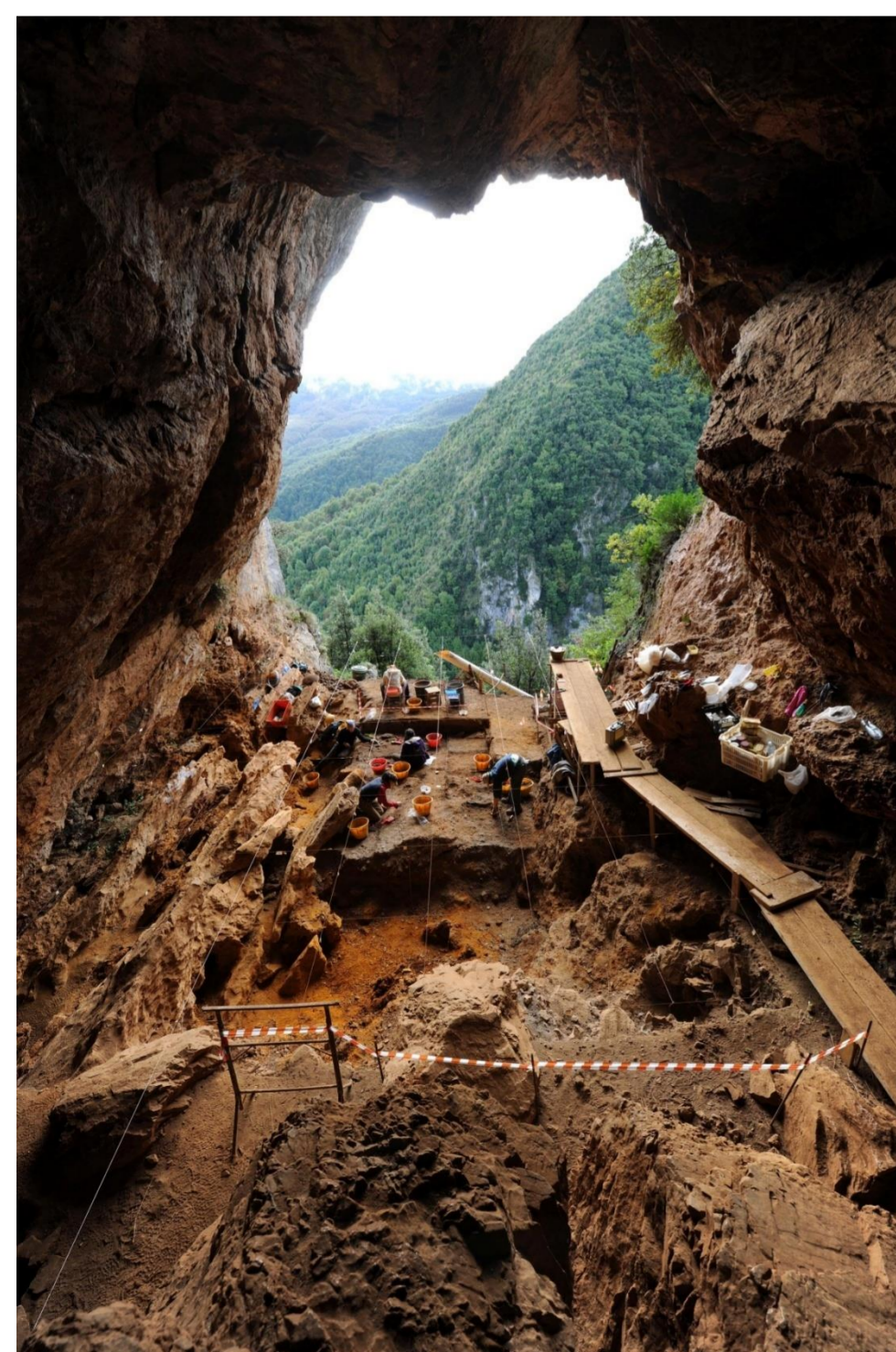
Grotta della Monaca (Sant'Agata di Esaro - CS)

Overall. Up until February 20, 2018 the regularly registered caves in Calabria are 425, mostly located in the central-northern sector of the region. The major karst areas are in the North, where there are remarkable carbonatic reliefs (massif of Pollino and Orsomarso mountains), as well as in the center, where there are important outcrops of chalky rocks (Crotone inland district). Elsewhere the karst phenomena are less vast and widely dispersed in the territory.